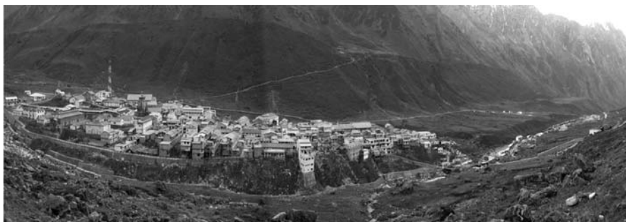
Figure 17.2 View of the temple township of Kedarnath, with camera looking east.

The disaster-affected area houses a number of sacred shrines and pilgrimage routes. Besides Chota Kailash-Kailash-Mansarovar and Hemkund Sahib these