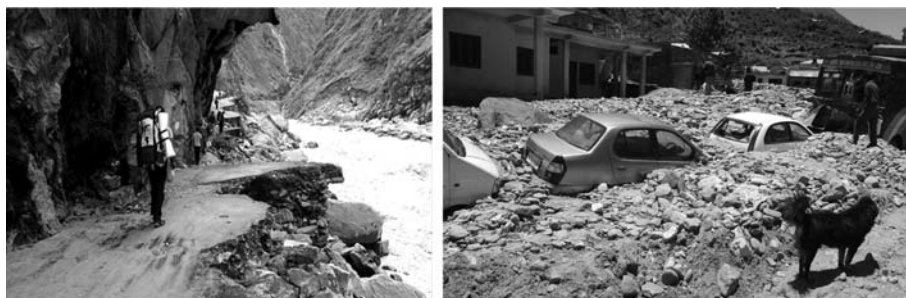
Figure 17.4 View of road disruption in June, 2013 due to bank erosion in the proximity of Tawaghat, Pithoragarh ( left ) and debris slide in Dharali, Uttarkashi ( right ).