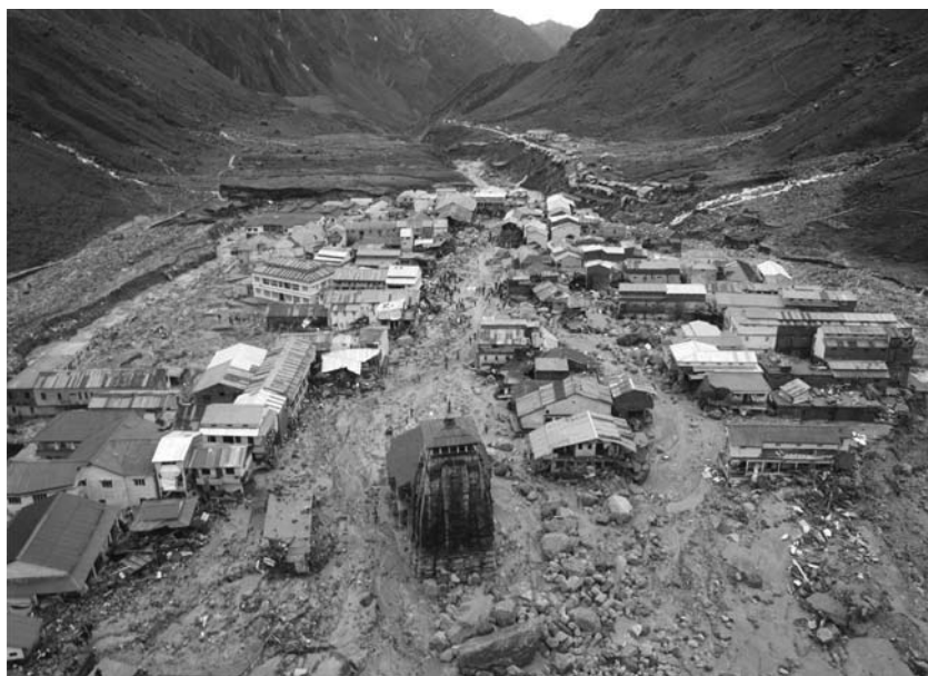
Figure 17.6 View of the Kedarnath township ravaged by the flood of June, 2013 with camera looking south.