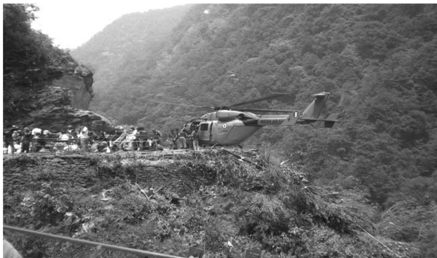
Figure 17.7 View of the aerial evacuation of pilgrims stranded on Rambara–Kedarnath track by Indian Air Force.

evacuated safely by road. Five hundred and eighty-six buses and 1440 taxis were thus requisitioned for evacuation. Seventy-one relief camps were organized across the state that catered to food, shelter, medical, and other needs of 151,629 persons for different durations.