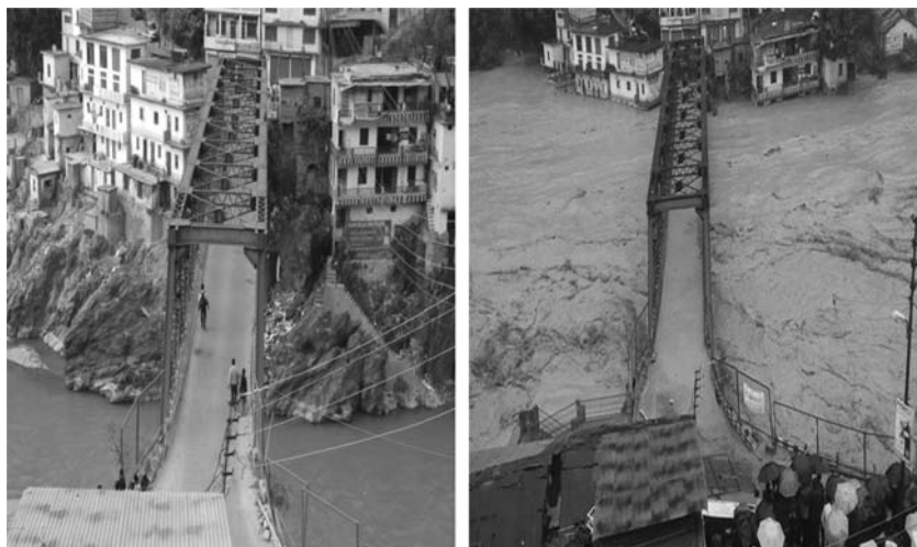
Figure 17.5 View of the motor bridge over Alaknanda at Rudraprayag in April, 2013 ( left ) and on June 17, 2013 ( right ) with camera looking NNW.